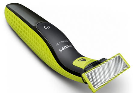
Final Philips OneBlade Product